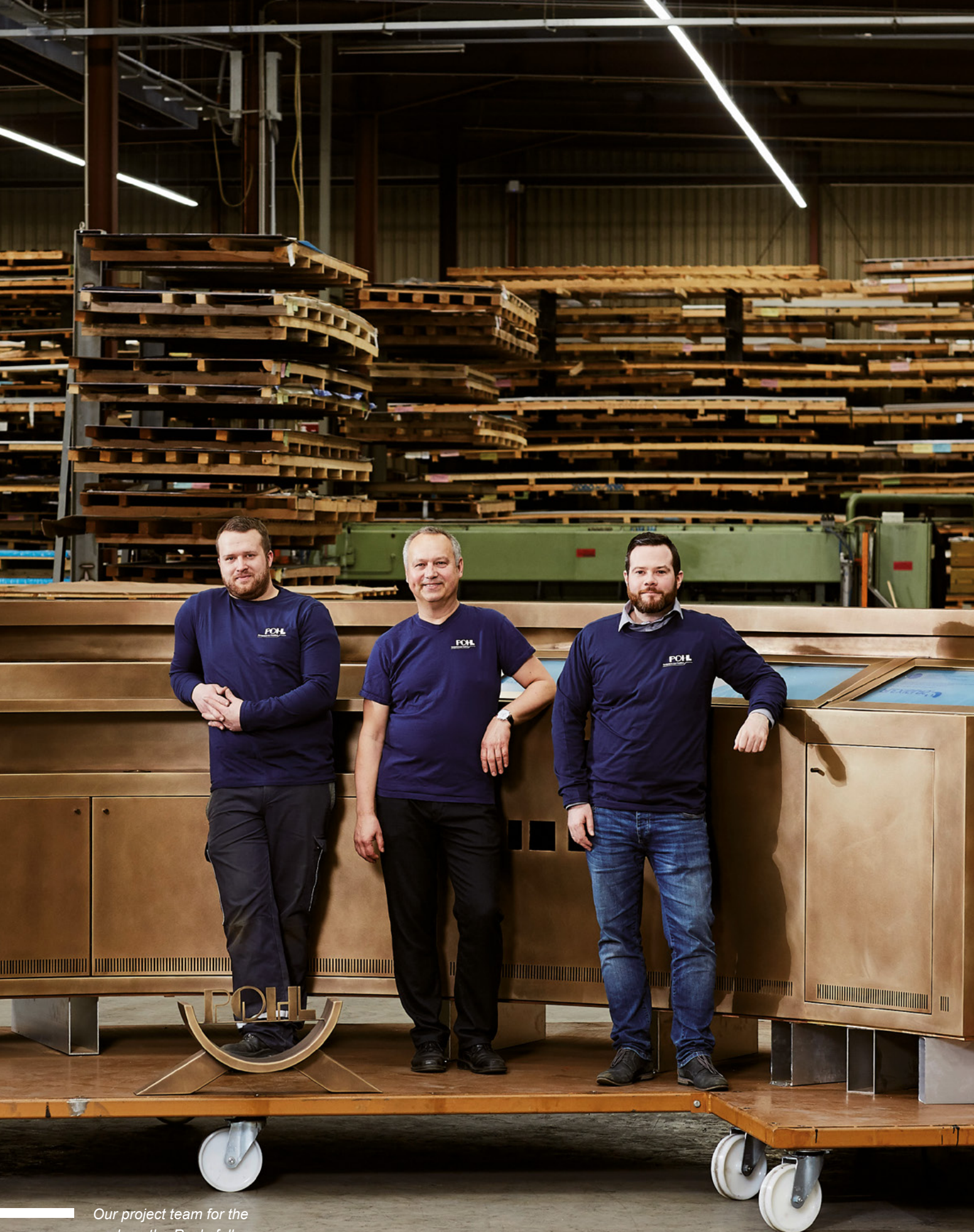
Our project team for the work on the Rockefeller Plaza Information Desk, New York (KPF Architects)